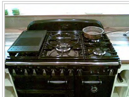
A kitchen stove with oven that operates using flammable gas