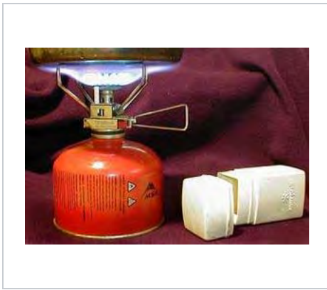
A small portable stove running on MSR gas and the stove's carrying case