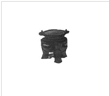
A brazier style of tea stove