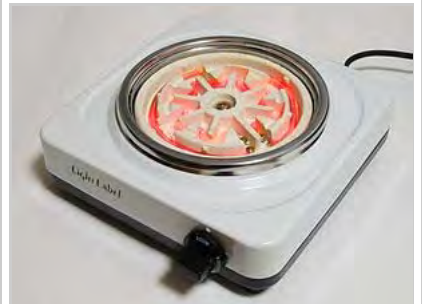
A hotplate-style electric tabletop burner