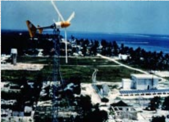
Xcalak hybrid power system - diesel retrofit completed in 1995