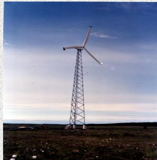
Atlantic Orient Corporation 50-kW wind turbine provides power to the Alaska Kotzebue Project.