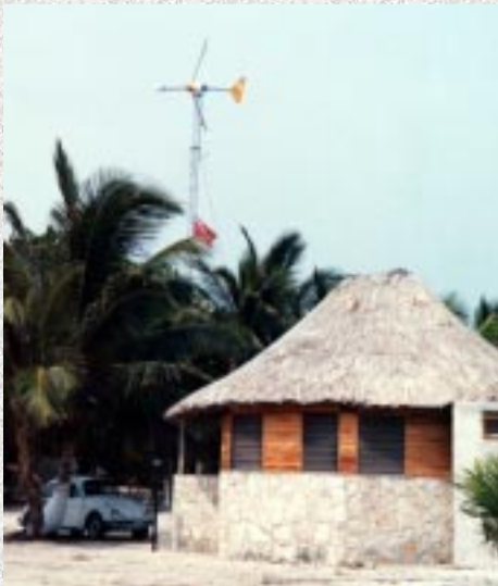
Costa de Cocos 11-kW wind-diesel hybrid system