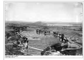
Rice paddies near Beijing in 1920