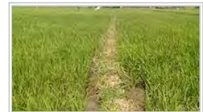
Paddy field in Pagbilao, Quezon, Philippines

The Banaue Rice Terraces is an example of paddy fields in the country, it is located in Northern Luzon, Philippines and were built by the Ifugaos 2,000 years ago. [35] Streams and springs found in the mountains were tapped and channeled into Irrigation canals that run downhill through the rice terraces. Other notable Philippine paddy fields are the Batad Rice Terraces, the Bangaan Rice Terraces, the Mayoyao Rice Terraces and the Hapao Rice Terraces. [36]