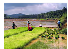
Paddy Fields in Idukki, India