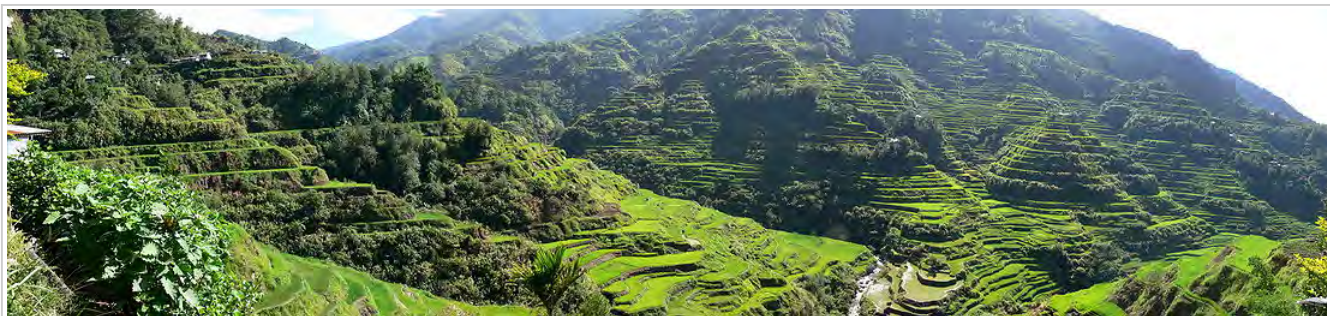
Panoramic view of the Banaue Rice Terraces in Ifugao, Philippines

Located at Barangay Batad in Banaue, the Batad Rice Terraces are shaped like an amphitheatre, and can be reached by a 12-kilometer ride from Banaue Hotel and a 2-hour hike uphill through mountain trails. The Bangaan Rice Terraces portray the typical Ifugao community, where the livelihood activities are within the village and its surroundings. The Bangaan Rice Terraces is accessible in a one-hour ride from Poblacion, Banaue, then a 20-minute trek down to the village. It can be viewed best from the road to Mayoyao. The Mayoyao Rice Terraces is located at Mayoyao, 44 kilometers away from Poblacion, Banaue. The town of Mayoyao lies in the midst of these rice terraces. All dikes are tiered with flat stones. The Hapao Rice Terraces can be reached within 55 kilometers from the capital town of Lagawe. Other Ifugao stone-walled rice terraces are located in the municipality of Hungduan. [36]