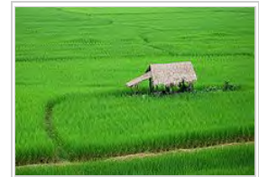
A small hut in between rice paddies on the outskirts of the town of Nan, Thailand

Thailand has a strong tradition of rice production. It has the fifth-largest amount of land under rice cultivation in the world and is the world's largest exporter of rice. [39] Thailand has plans to further increase its land available for rice production, with a goal of adding 500,000 hectares to its already 9.2 million hectares of rice-growing areas. [40] The Thai Ministry of Agriculture expected rice production to yield around 30 million tons of rice for 2008. [41] The most produced strain of rice in Thailand is jasmine rice, which is a higher quality type of rice. However, jasmine has a significantly lower yield rate than other types of rice, but it also normally fetches more than double the price of other strains in a global market. [40]