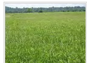
Paddy field in the state of Terengganu, Malaysia