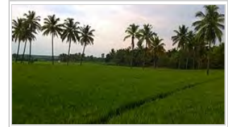
Irrigated paddy fields at Davanagere, India