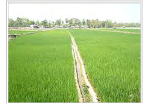
Two paddy fields in Khulna, Bangladesh