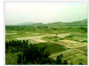
Paddy fields prior to planting in Andhra Pradesh, India

Arable land in small alluvial flats of most rural river valleys in South Korea are dedicated to paddy-field farming. Farmers assess paddy fields for any necessary repairs in February. Fields may be rebuilt, and bund breaches are repaired. This work is carried out until mid-March, when warmer spring weather allows the farmer to buy or grow rice seedlings. They are transplanted (usually by rice transplanter) from the indoors into freshly flooded paddy fields in May. Farmers tend and weed their paddy fields through the summer until around the time of Chuseok, a traditional holiday held on 15 August of the Lunar Calendar (circa mid-September by Solar Calendar). The harvest begins in October. Coordinating the harvest can be challenging because many Korean farmers have small