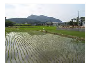
Paddy field near Namwon, South Korea, early June