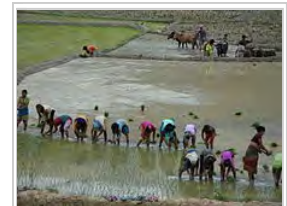
Planting in paddy fields in Nepal