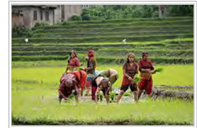
Women planting rice in Nepal

In Nepal, rice (Nepali: धान , Dhaan) is grown in the Terai and hilly regions. It is mainly grown during the summer monsoon in Nepal. [34]