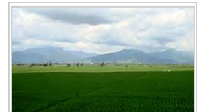
Paddy fields in Tamil Nadu, India