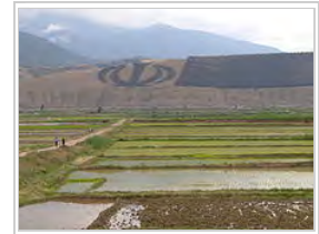
Traditional planting in northwestern Iran