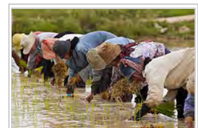
Farmer planting rice in Cambodia