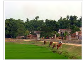
A rice field in Vietnam

Rice fields in Vietnam ( ruộng or cánh đồng in Vietnamese) are the predominant land use in the valley of the Red River and the Mekong Delta. In the Red River Delta of northern Vietnam, control of seasonal riverine floodings is achieved by an extensive network of dykes which over the centuries total some 3000 km. In the Mekong Delta of southern Vietnam, there is an interlacing drainage and irrigation canal system that has become the symbol of this area. It jointly serves as transportation routes, allowing farmers to bring their produce to market. In Northwestern Vietnam, Thai people built their " valley culture " based on the cultivation of glutinous rice planted in upland fields, requiring terracing of the slopes.