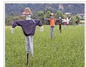
Paddy field scarecrows in Japan