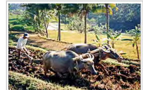
Water buffaloes were formerly used to plough muddy paddy fields in Indonesia although the use of mechanised methods, such as small powered ploughs, has become much more common in recent years.