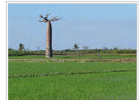
Baobab and rice field near Morondava, Madagascar

The fields are tilled when the first rains arrive – traditionally measured at 40 days after Thingyan, the Burmese New Year – around the beginning of June. In modern times, tractors are used, but traditionally, buffalos were employed. The rice plants are planted in nurseries and then transplanted by hand into the prepared fields. The rice is then harvested in late November – "when the rice bends with age". Most of the rice planting and harvesting are done by hand. The rice is then threshed and stored, ready for the mills.