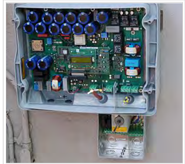
Internal view of a solar inverter. Note the many large capacitors (blue cylinders), used to store energy briefly and improve the output waveform.

A solar inverter , or converter or PV inverter , converts the variable direct current (DC) output of a photovoltaic (PV) solar panel into a utility frequency alternating current (AC) that can be fed into a commercial electrical grid or used by a local, off-grid electrical network. It is a critical balance of system (BOS)–component in a photovoltaic system, allowing the use of ordinary AC-powered equipment. Solar power inverters have special functions adapted for use with photovoltaic arrays, including maximum power point tracking and anti-islanding protection.