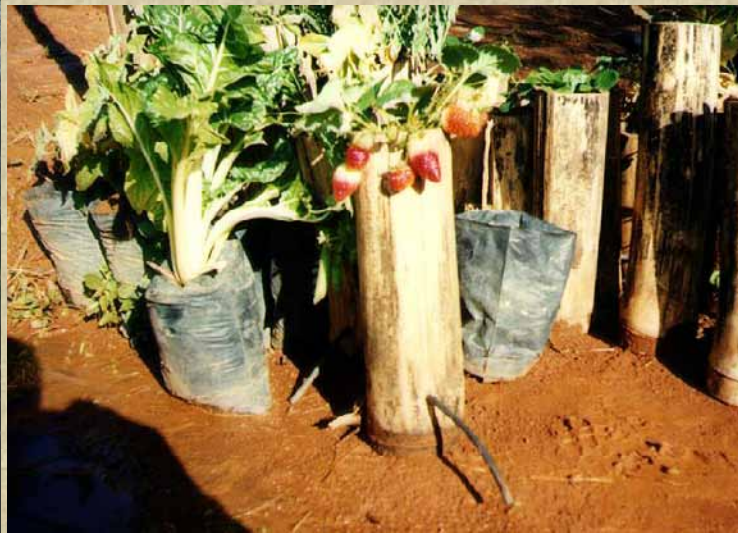
Bamboo containers with drain holes for excess nutrient. Plants are ready to produce or be transplanted.