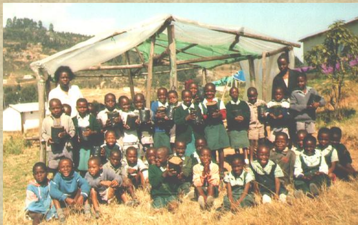
The third grade class begins hydroponics with each child starting their own plant.