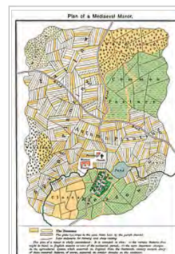
Typical plan of a mediaeval English manor, showing the use of field strips