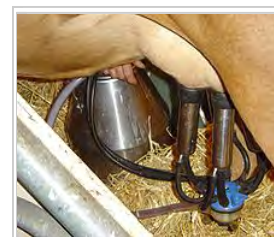
A milking machine in action