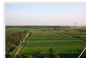
Farmlands in Hebei province, China