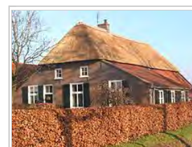
Traditional Dutch farmhouse