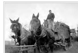
A farmer harvesting crops with mule-drawn wagon, 1920s, Iowa, USA

A farm may operate under a monoculture system or with a variety of cereal or arable crops, which may be separate from or combined with raising livestock. Specialist farms