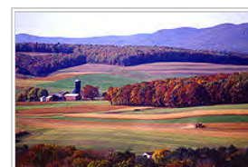
Farming near Klingertown, Pennsylvania