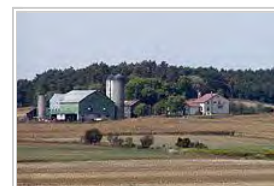
A typical North American grain farm with farmstead in Ontario, Canada