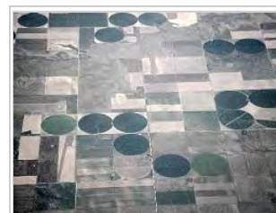
Farmland in the United States. The round fields are due to the use of center pivot irrigation