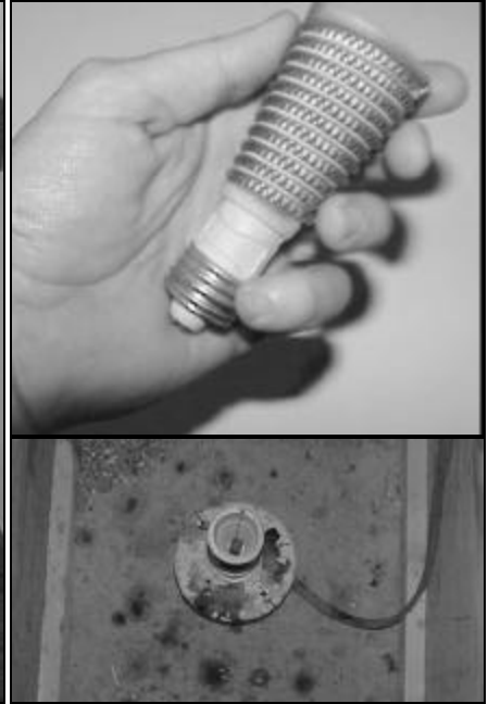
Left: The dryer cabinet and the polycarbonate trays. Right: The 600-watt ceramic heat coil screws into an ordinary porcelain lamp base.

Whatever the size or material of your trays, design the cabinet size around them allowing for sufficient room below for the heat element and room to easily fit the trays within. I am providing the measurements below to serve only as a guide for your own construction process, because the type and size of trays that you come up with may vary from that which I devised. Our dryer measures 48" tall by 14¾" wide by 16" deep. The trays themselves measure 13¾" square. A slightly different size tray is available from Excalibur Dehydrators, listed at the end of this article.