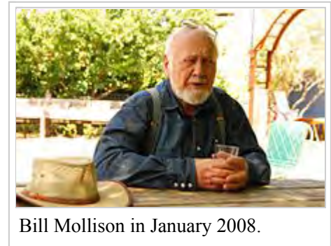
Bill Mollison in January 2008.

In the late 1960s, Bill Mollison and David Holmgren started developing ideas about stable agricultural systems on the southern Australian island state of Tasmania. This was a result of the danger of the rapidly growing use of industrial-agricultural methods. In their view, [9] these methods were highly dependent on non-renewable resources, and were additionally poisoning land and water, reducing biodiversity, and removing billions of tons of topsoil from previously fertile landscapes. A design approach called permaculture was their response and was first made public with the publication of their book Permaculture One in 1978. [9]