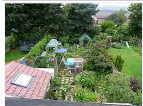
Suburban permaculture garden in Sheffield, UK with different layers of vegetation

Layers are one of the tools used to design functional ecosystems that are both sustainable and of direct benefit to humans. A mature ecosystem has a huge number of relationships between its component parts: trees, understory, ground cover, soil, fungi, insects, and animals. Because plants grow to different heights, a diverse community of life is able to grow in a relatively small space, as the vegetation occupies different layers. There are generally seven recognized layers in a food forest, although some practitioners also include fungi as an eighth layer. [18]