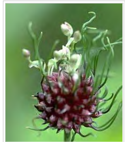
Crow garlic, like any allium, masks scents from pest insects, protecting neighboring plants

Some beneficial weeds repel insects and other pests through their smell [2]