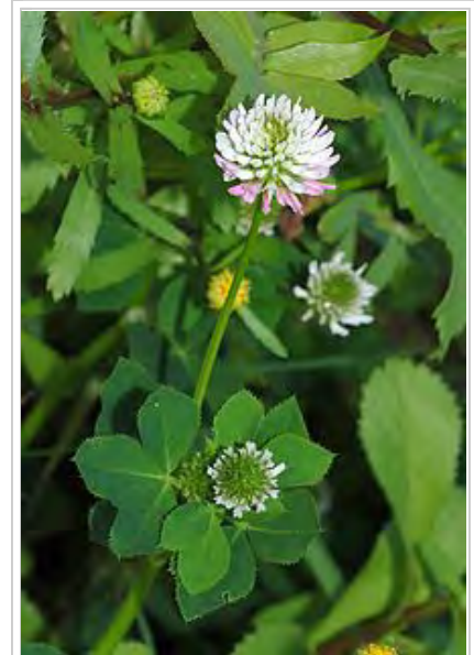
Clover was once included in grass seed mixes, because it is a legume that fertilizes the soil