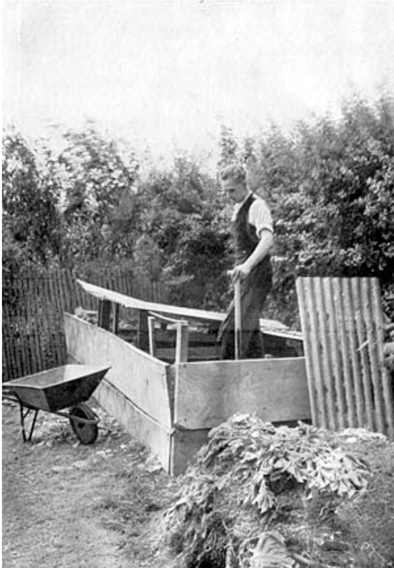
Plate 3. In a town garden: 'Lightly treading it down'

Following this line of thought, I have heard of people getting offal and remains from the butcher's refuse, as a weekly offering to the compost heap; but again, to do so would be to over-balance the heap, and go beyond Nature's own scheme. One or two odd mice or birds buried in the heap will disappear, and be absorbed by the mass of vegetable matter and the work of the micro-organisms, but for a garden heap, I counsel no weekly offerings of flesh and no metal. Don't call it a rubbish heap, or it will be treated as one!