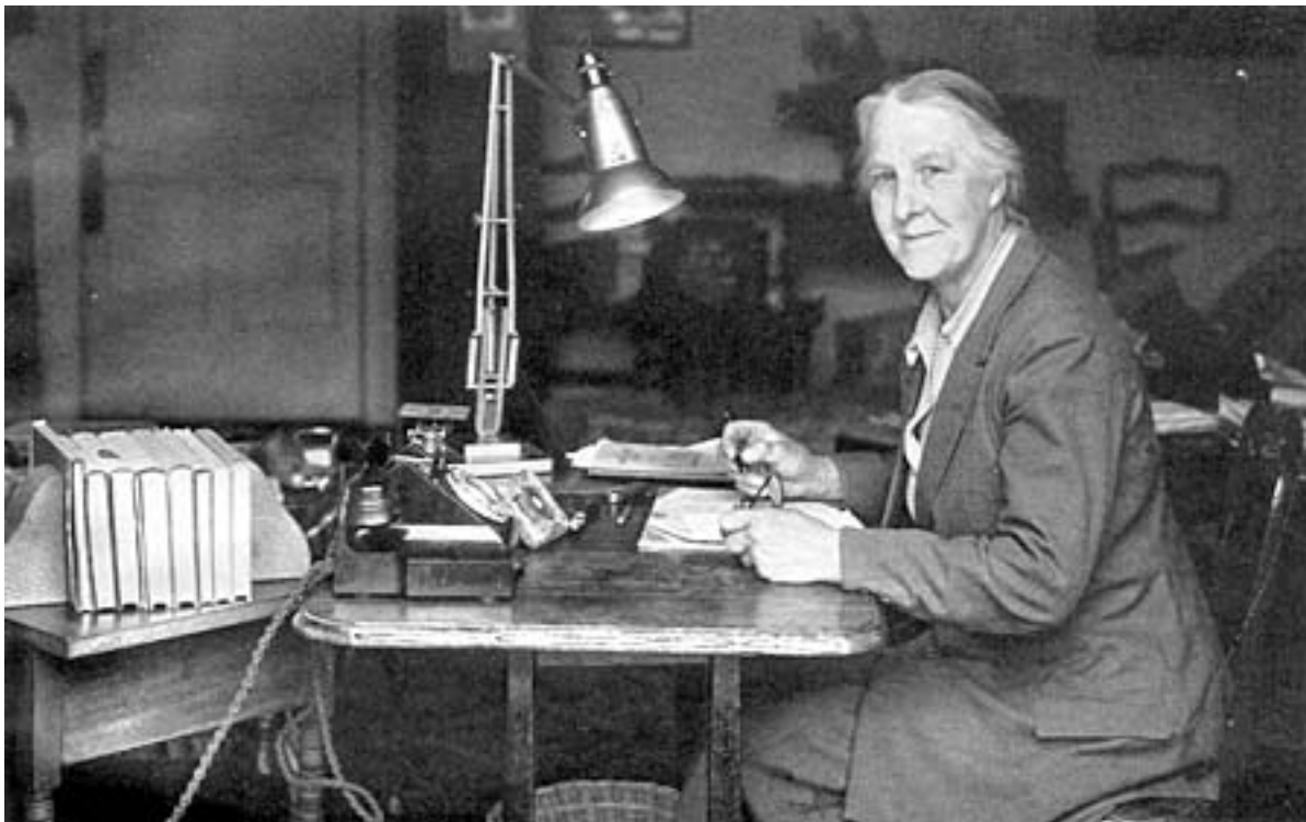
Plate 1: Portrait of the author

This book describes a way of making compost, i.e. humus, which is simply, labour saving (no turning) and quick, both in ripening the compost and in getting results in the soil. It is adaptable to all conditions and to every size and type of garden, allotment or farm, the process being based on nature's own methods.