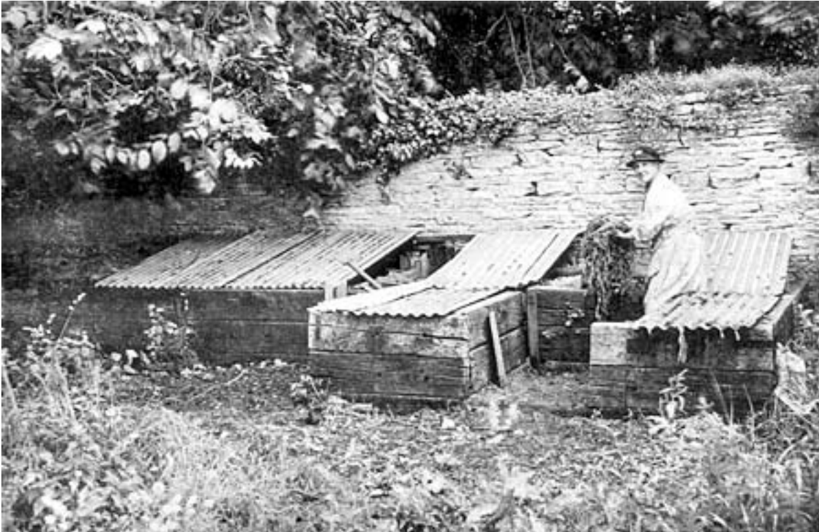
Plate 2. In the compost yard: The main range of bins

It is advisable, though not essential, to scatter a few handfuls of charcoal on the floor of the bin. Why? Because charcoal absorbs unpleasant gases, and remains itself unchanged. For this reason, it is given in the form of charcoal biscuits to relieve indigestion. It is also used in filters, and, in increasing quantities, in gardens, especially as drainage for pots and seed boxes. It is easy to make. Build a small bonfire, with brash wood (old pea sticks) and when it is red hot, pour some water on it -- you will get charcoal.