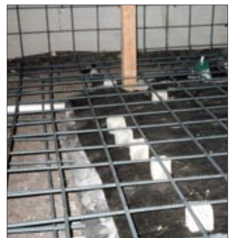
Figure 3. Concrete “dobies” are used to hold rebar off the ground or away from forms, ensuring adequate concrete coverage and preventing rust.

Tie wire comes in rolls, or in bundles of pre-cut lengths. We like to