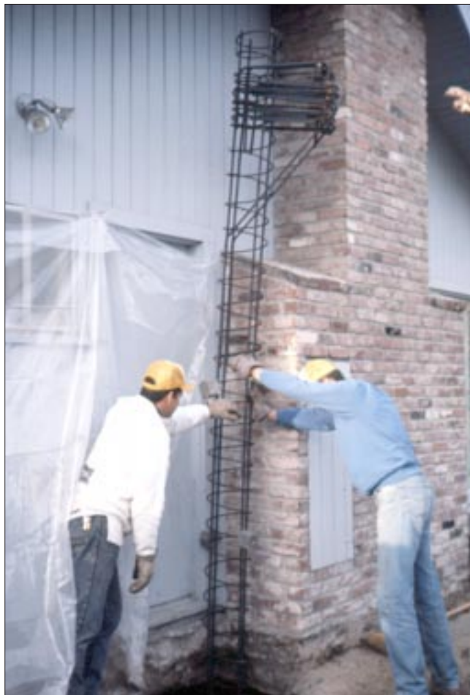
Figure 1. For deep concrete piers, the author uses steel cages made from #3 rebar spirals with #5 rebar in the middle. The cage shown here will help support the brick chimney in a foundation underpinning job.

primary grade classifications, commonly known as grade 40 and grade 60. Grade 40 is more malleable and easier to bend. Grade 60 is stiffer and does not bend as easily. Generally, grade 40 is found in #3 and #4 bar, and grade 60 in #5 and larger.