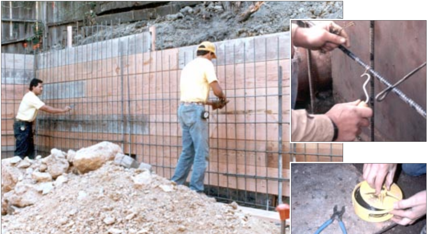
Figure 4. The author ties the rebar at every intersection. Precut wire can be bought in bundles and twisted with a special swiveling tool (top right), but the author's crew prefers to use a pair of spring-loaded linesman's pliers and a roll of wire on a spool (right).

use the roll-type that comes on a special spool that can be worn on a work belt. The spool conveniently dispenses the tie wire as needed without tangles. We tie the wire with special spring-loaded linesman's pliers that gently open by themselves, making it easy to grasp, wrap, twist, and cut.