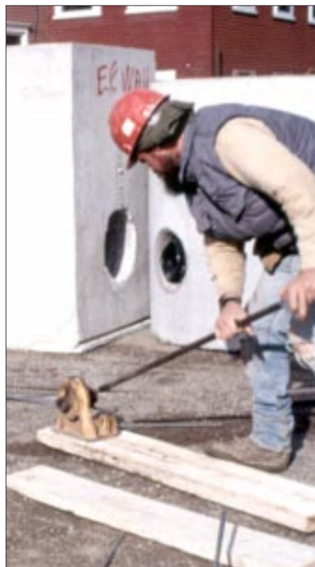
Figure 2. The author uses an oxyacetylene torch to cut large-diameter rebar (left), while #3 and #4 can be cut and bent with a combination cutting and bending tool (right).