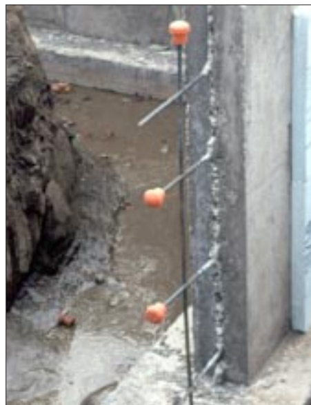
Figure 5. The exposed ends of rebar can cause fatal accidents. OSHA regulations call for rebar ends to be covered with high-visibility protective caps.

OSHA now requires that all rebar ends be covered with high-visibility plastic safety caps (Figure 5). This is one rule that I strongly support. It is worth making the effort to train people to put those caps on, and to be aware of the risk. We take the caps off when the concrete gets poured, and caps come off by accident, too. At any given time, there are probably some exposed ends around. I just try to stay continuously vigilant, and make sure my workers remember to put the caps on and keep them on. ■