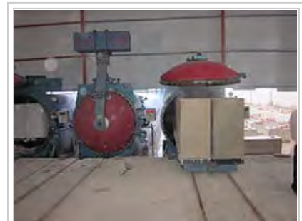
On the right, green AAC blocks are being fed into an autoclave to be rapidly cured under heat and pressure