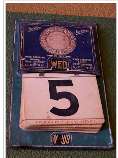
A calendar from the Petaluma and Santa Rosa Railroad