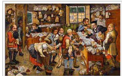
The Payment of the Tithes (The tax-collector), also known as Village Lawyer , by Pieter Brueghel the Younger or workshop

In accounting (and particularly accounting software), a fiscal calendar (such as a 4/4/5 calendar) fixes each month at a specific number of weeks to facilitate comparisons from month to month and year to year. January always has exactly 4 weeks (Sunday through Saturday), February has 4 weeks, March has 5 weeks, etc. Note that this calendar will normally need to add a 53rd week to every 5th or 6th year, which might be added to December or might not be, depending on how the organization uses those dates. There exists an international standard way to do this (the ISO week). The ISO week starts on a Monday, and ends on a Sunday. Week 1 is always the week that contains 4 January in the Gregorian calendar.