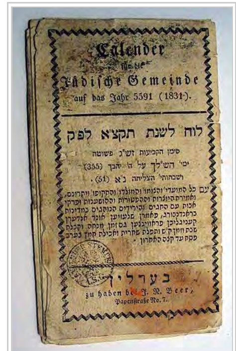
Calendar of the Qahal, 5591 (1831)

Each Gregorian year has either 365 or 366 days (the leap day being inserted as 29 February), amounting to an average Gregorian year of 365.2425 days (compared to a solar year of 365.2422 days). It was introduced in