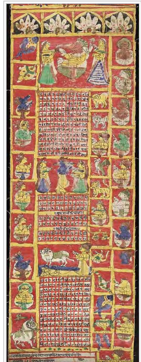
A Hindu almanac ( pancanga ) for the year 1871/2 from Rajasthan (Library of Congress, Asian Division)

The Hebrew calendar is used by Jews worldwide for religious and cultural affairs, also influences civil matters in Israel (such as national